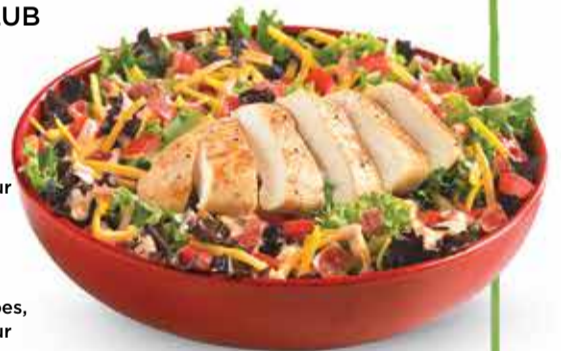
GRILLED CHICKEN CLUB SALAD

GARDEN SALAD Crisp romaine & iceberg lettuce topped with fresh diced tomatoes, shredded cheddar cheese & your choice of dressing. 25